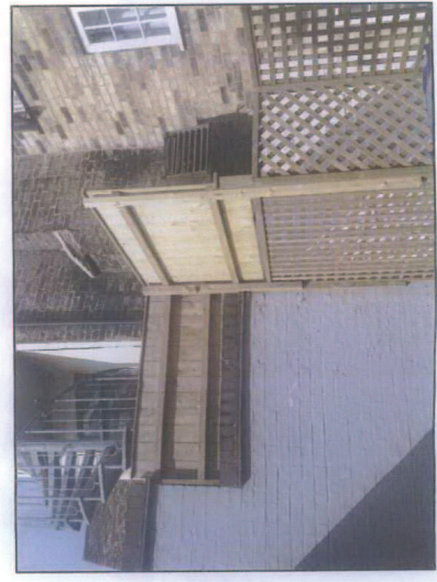
View from within private yard facing neighbouring property (The King Street Run)