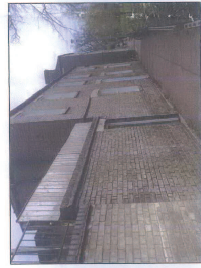
View from public footpath