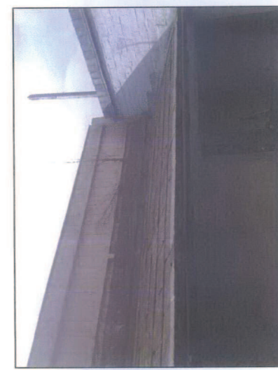
View from within private yard facing public footpath